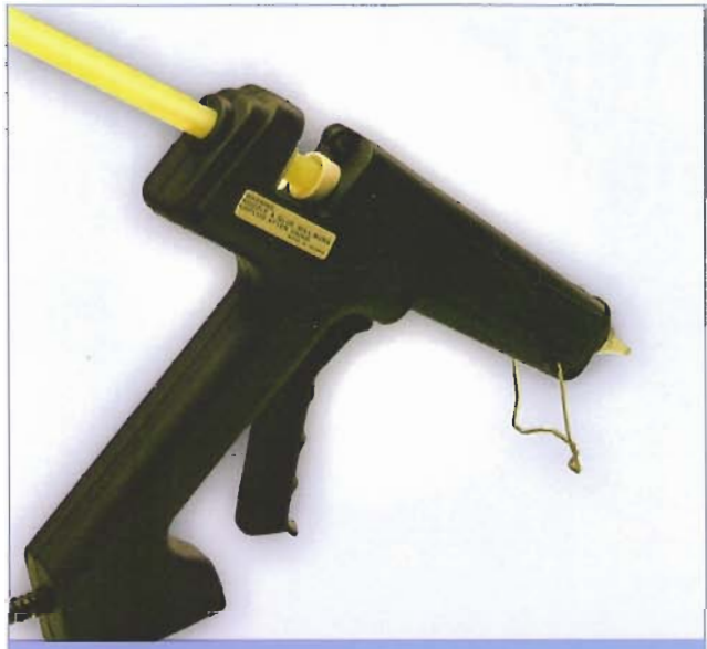
INDUSTRIAL GLUE GUN Uses 1/2" diameter glue sticks (HMG-IND)