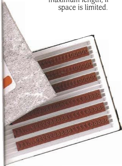
Our Value Pack figure assortment, available from inventory

A logotype - or "logo" - is a single line of characters molded in one piece (a word, trademark or code, for instance). Logos provide superior quality impressions over combinations of single characters because of uniform typeface wear. They also save time and minimize costly spelling and coding errors. Orders should indicate character size, style and maximum length, if space is limited.